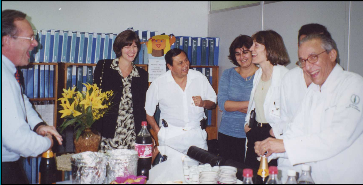
Champagne in Sao Paulo