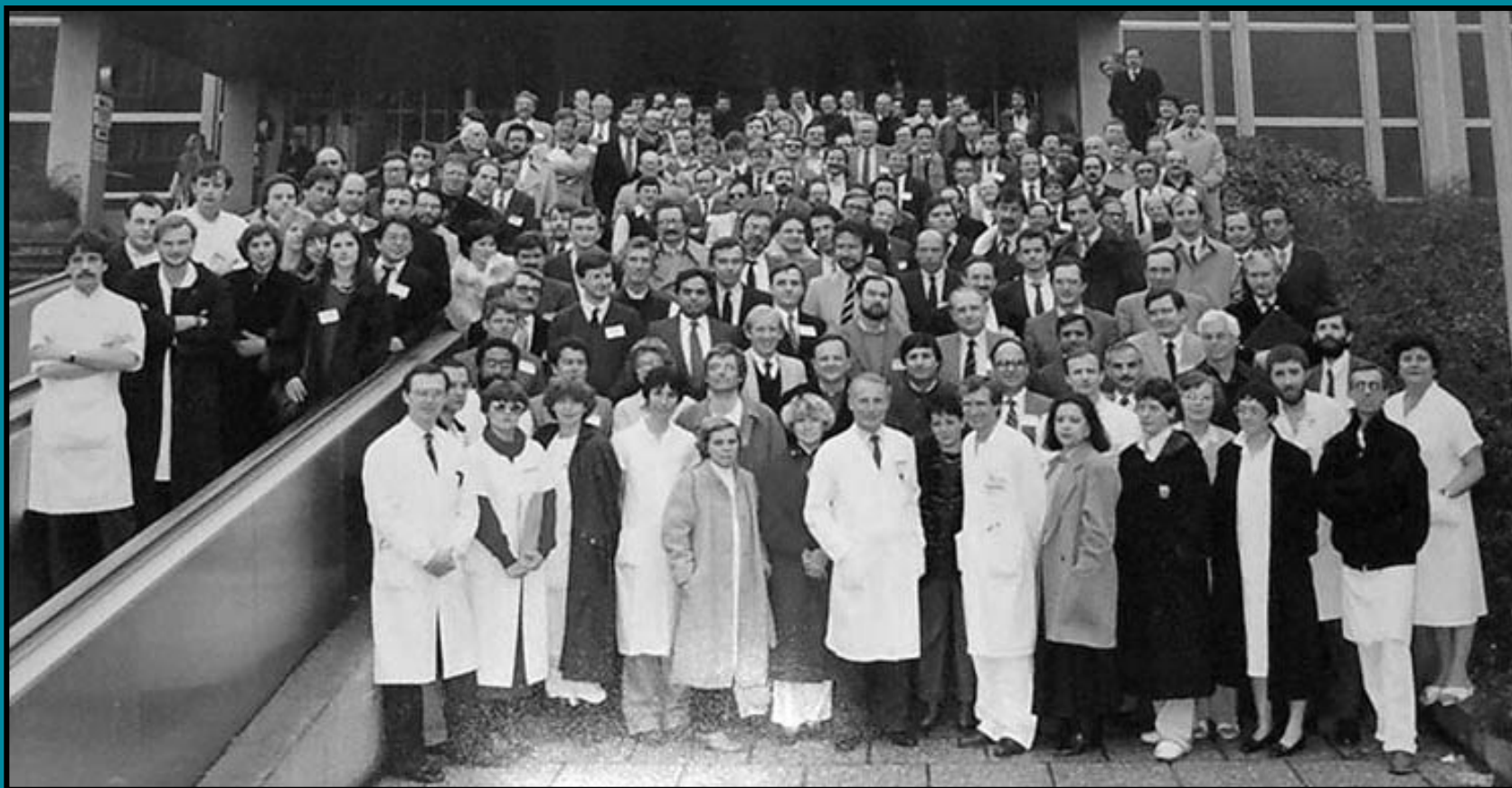
Live course on balloon valvuloplasty in Rouen (France)