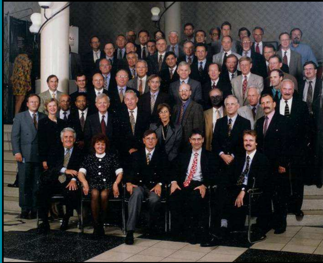
Group photograph taken in Zurich in 1997 on the twentieth anniversary of interventional cardiology, featuring many of the pioneers featured in this slide set